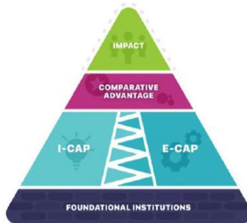
-- Figure 1: MIT “system” for Innovation --

To simplify the phenomenon of 'Innovation', we draw on MIT analysis of systems (both systems thinking and systems dynamics) to explore a framework for better understanding why innovation is stronger in some ecosystems than others. The framework emphasizes the role of two critical 'capacities' that together serve as the 'twin engines' of innovation ecosystems, and that need to be developed for such ecosystems to thrive: these are namely innovation capacity (I-Cap), and entrepreneurship capacity (E-Cap), which rest up foundational institutions. At the ecosystem level, these capacities are often focused around specific areas of comparative advantage which lead to impact.